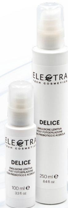
DELICE Soothing post photoepilation emulsion