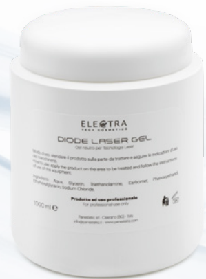
DIODE Laser gel

Specific cosmetic products to work in synergy with technologies, maximising the effectiveness of the Delighter 2000W hair removal treatment: