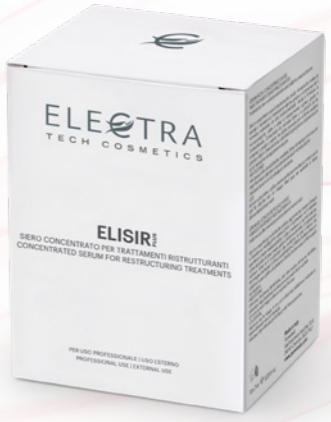
ELISIR PLUS Concentrated serum for restructuring treatments