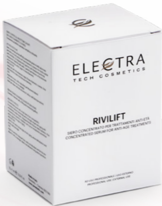
RIVILIFT Concentrated serum for anti-age treatments

Discover our line of active mesoporation ampoules for the Dermoporation and Oxyflow handpiece: